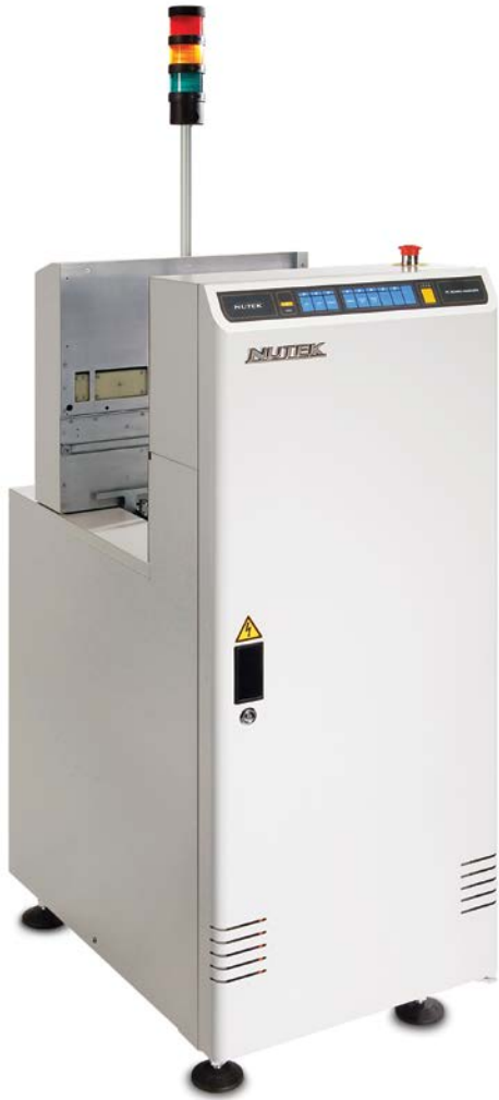
* Tower light (optional)