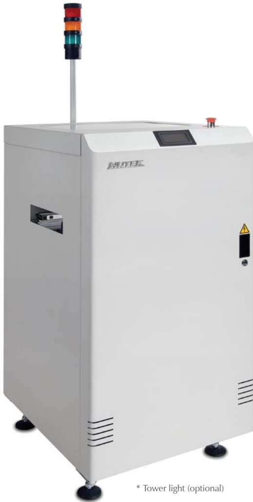
* Tower light (optional)