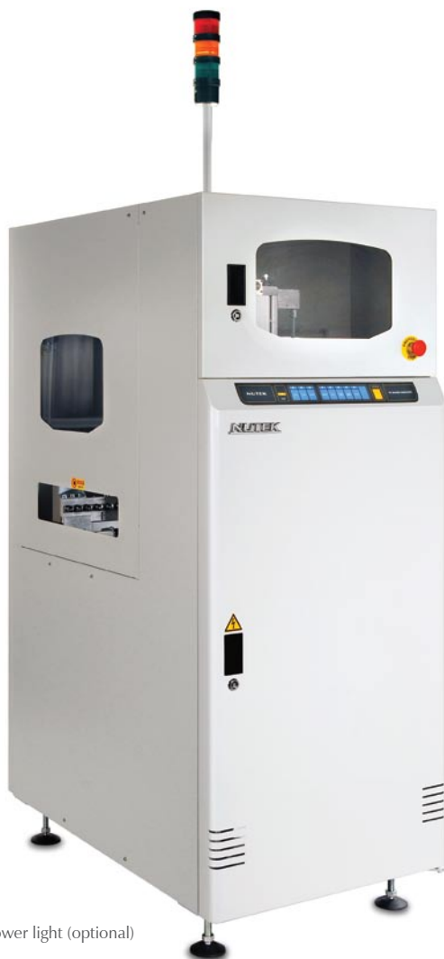
* Tower light (optional)